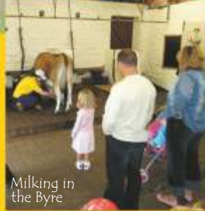
Milking in the Byre