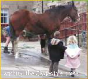
washing the Clydesdale horse