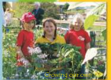
Growing our own